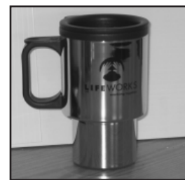
Mugs - $14