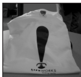
Tees - $10

Need some new gear for spring? Then why not pick up some great SCE LifeWorks merchandise! You'll not only look stylish, you will be supporting SCE LifeWorks at the same time. Currently in stock we have black ball caps with our name on the back, our exclamation T's (available in small, medium, large & x-large) and our new copper travel mugs. To purchase any of these great items, simply stop by the SCE LifeWorks office, or call Susan at 775-9402.