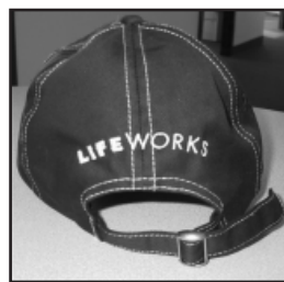
Caps - $10